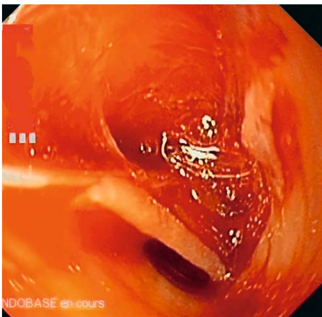
► Fig. 2 Gastroduodenal endoscopy (case 5) showing esophageal dissection with dilacerations of the mucosa and the submucosa.

ing food impaction and two cases were perforations during an endoscopic process. The three children with spontaneous perforation consulted the emergency department for sudden thoracic pain with vomiting, following a food blockage. One child also had hematemesis with fever. The other two cases of perforation occurred during gastroduodenal fibroscopy program-