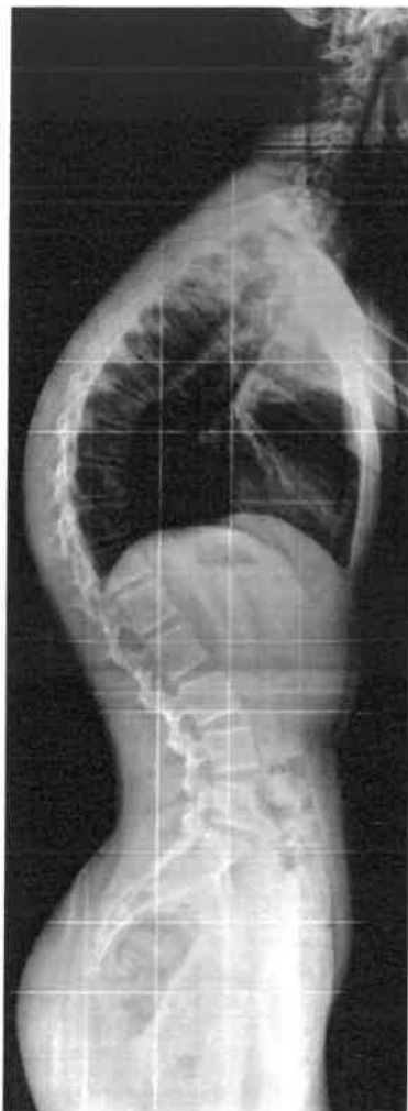
FIGURE 2 | Profile x-ray of the spine.

the 95% confidence interval (CIs) using the Clopper–Pearson method. Univariate and multivariate logistic regression models were used to identify the risk factors for SPA using Firth’s penalized-likelihood approach to account for the small sample size (9). Factors associated with SPA in univariate analysis (at P < 0.10 ) were added as candidate variables to the multivariate analysis using a backward-stepwise selection procedure with P < 0.10 as the selection criterion. Before developing the multivariate model, we examined the absence of collinearity between the candidate predictors by calculating the variance inflation factors (10). Odds ratios (ORs) and their 95% CIs were derived as effect sizes from logistic models. We examined the performance of the selected models in terms of calibration using the Hosmer–Lemeshow goodness-of-fit test and discrimination by calculating the c-statistics (11). Statistical testing was performed at the two-tailed \alpha level of 0.05. Data were analyzed using SAS software (version 9.4, SAS Institute Inc., Cary, NC, USA).