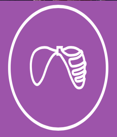
Malformations of the diaphragm and abdominal wall